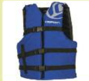
Summertime Safety page 6