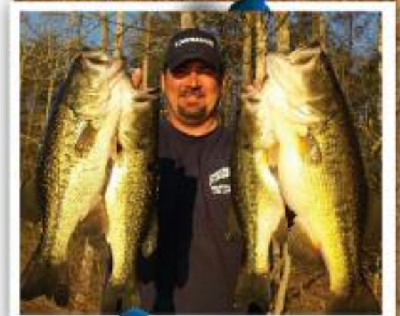
CVO clients pose with a limit of Lake Anna Stripers caught on deep diving crankbaits during "Happy Hour"