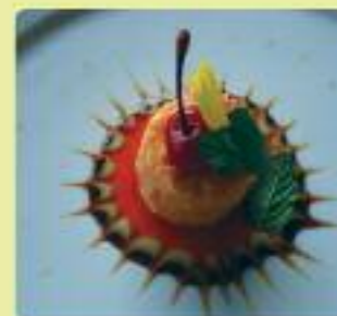
Crazy Good Eats UMI Japanese page 11