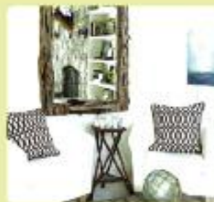
Sprucing Up For Spring page 13