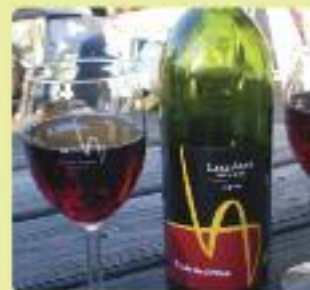
Local Event Listings page 8