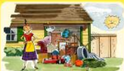
Lucy is Not Happy