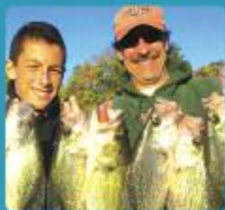
Lake Anna Fishing Report page 7