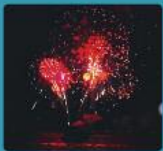
Scenes from Lake Anna page 5