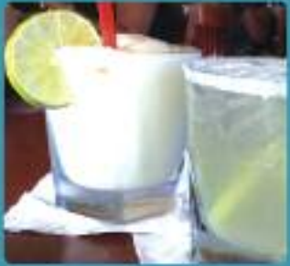
Crazy Good Eats page 11