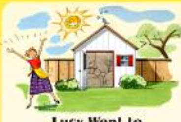
Lucy Went to Capitol Sheds!