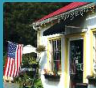
End of Summer Reflections page 13