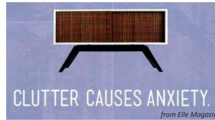
from Elle Magazine

Several years ago, I discovered a delightful online newsletter that quietly graces my online mailbox daily. It's easy on the eye and just reading the themes of the short pieces to follow pull you in, even though sometimes you don't have the time. The site is mindbodygreen.org , reflecting many different cultures and beliefs. Inner Peace is subtly interwoven throughout all of the pieces. Hopefully, each of us have our personal "calm in the hectic", our constant go-to for inner peace.