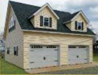
Customized Garages That Meet Your Needs!

No Money Down & 0% 24-36 Mos. Financing. Apply Today! Certain Restrictions Apply