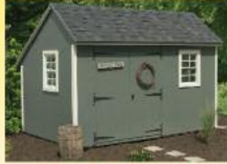
Storage Sheds to Meet Your Needs!

No Money Down & 0% 24-36 Mos. Financing. Apply Today! Certain Restrictions Apply