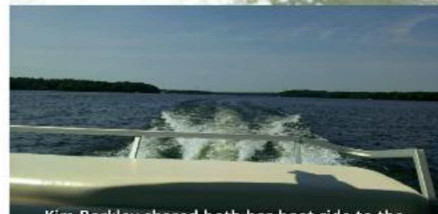
Kim Berkley shared both her boat ride to the Islands and the volleyball net there!