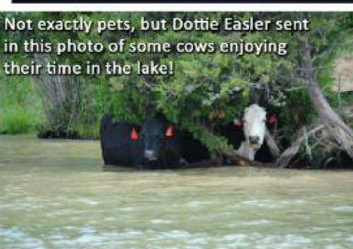
Not exactly pets, but Dottie Easler sent in this photo of some cows enjoying their time in the lake!