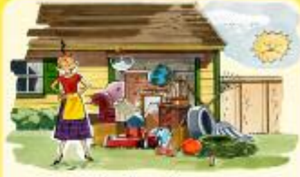
Lucy is Not Happy