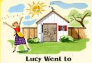
Lucy Went to Capitol Sheds!