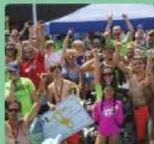
Crunkfest Returns to Lake Anna 6/27 page 6