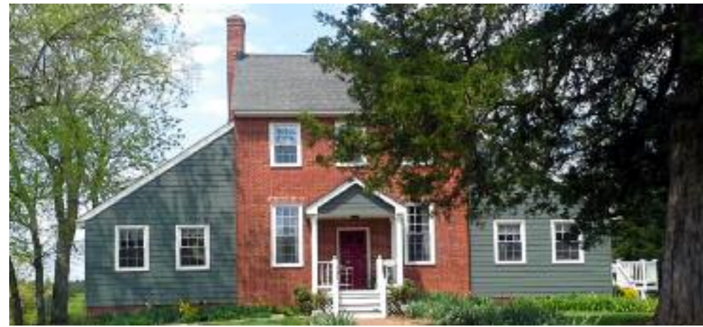
(left) The home as it looks today.