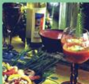
Dining Alfresco Lake Anna page 13