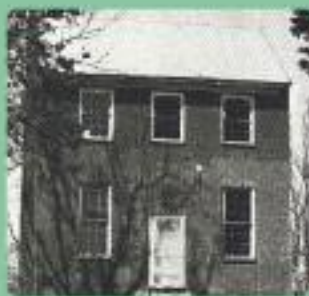
Historic Home For Sale page 14