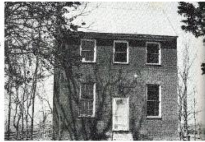
(right) The original house.