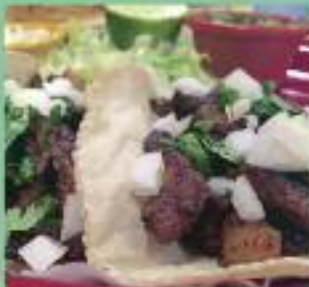
Crazy Good Eats page 11