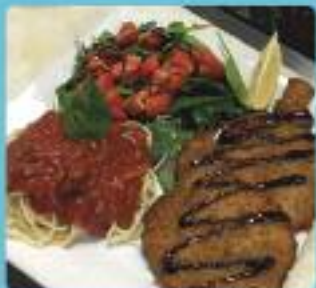
Dining Review Page 11