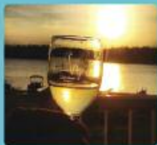
Local Lake Anna Area Events Page 8