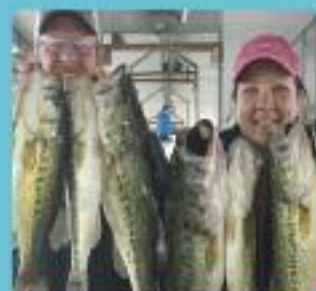
Lake Anna Outdoors Page 7