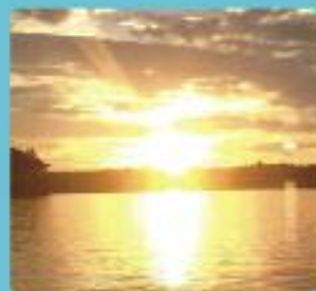
Scenes from Lake Anna Page 5