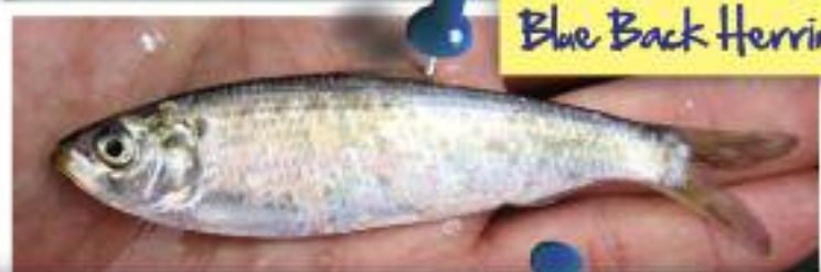
Blue Back Herring