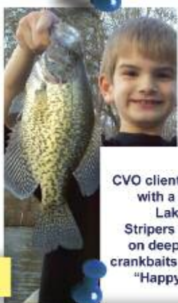
CVO clients pose with a limit of Lake Anna Stripers caught on deep diving crankbaits during "Happy Hour"