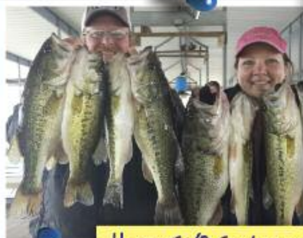
Happy CVO Customers

HOW - The most popular weapon during the shad and herring spawn is the spinner bait equipped with silver or gold willow blades and white or white and chartreuse skirts. Use a trailer hook! This bait is so deadly during the bait spawn that anglers are often fooled into throwing all summer long remember past success....don't be that guy. A weightless soft plastic jerk bait (such as Strike King's Caffeine Shad), the bladed swim jig (such as Z-Man's Chatterbait), and a topwater bait (either a buzz bait, walking bait, or popper) will round out your arsenal. When the action is hot you can't get your line in the water fast enough. Once the sun gets up over the treetops it will die off quick. Slow down and probe the bottom for a few pity strikes and then wait for tomorrow.